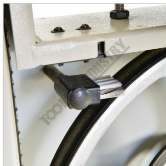
Wheel Cleaning Brush