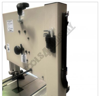
Push Stick and Tools