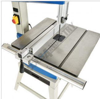
Sliding Rip Fence with High and Low Height Extrusion