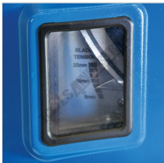
Blade Tension Scale