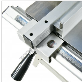
Fence with Quick Action Lock and Sight Glass