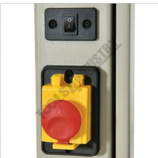
Safety Magnetic Switch and Light Switch