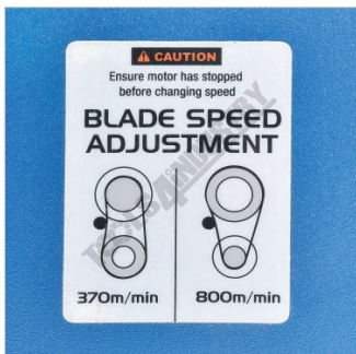
Blade Speed Adjustment