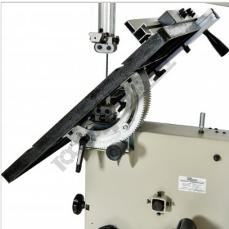
Tilt Table Adjustment