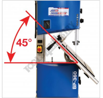
Cast Iron Tilt Table to 45 Degrees