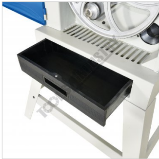
Dust collection Tray