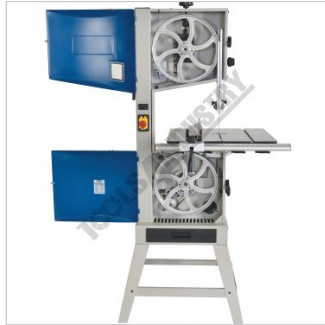
Easy Access for Blade Change