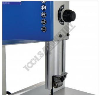
Blade Support Adjustment