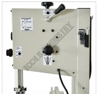
Blade Tension and Tracking Adjustments