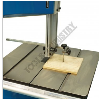
Shown with Optional Circle Cutting Attachment