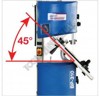
Cast Iron Tilt Table to 45 Degrees