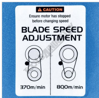
Blade Speed Adjustment