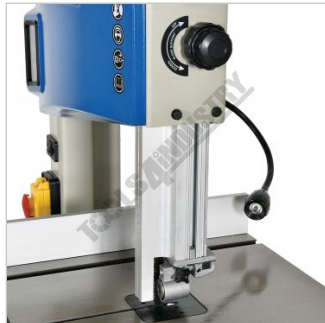
Blade Support Adjustment