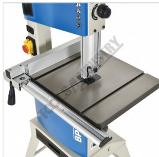
Cast Iron Table with T Slot