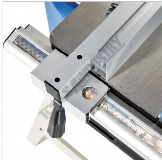
Sliding Rip Fence with High and Low Height Extrusion