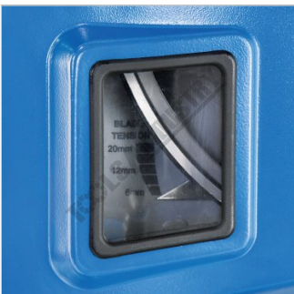
Blade Tension Scale