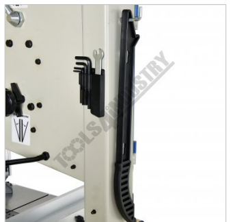
Push Stick and Tools