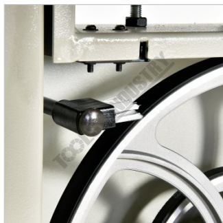
Wheel Cleaning Brush