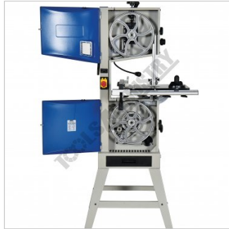
Easy Access for Blade Change