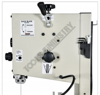
Blade Tension and Tracking Adjustments