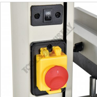
Safety Magnetic Switch and Light Switch