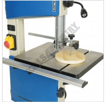
Close Up Shown On BP 255 Wood Bandsaw W950