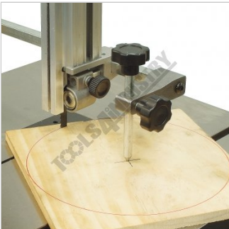
CCA 255 Circle Cutting Attachment