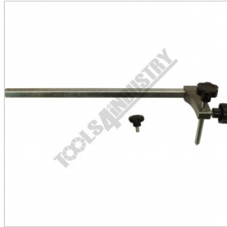
Circle Cutting Attachment