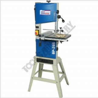
Shown On BP 255 Wood Bandsaw W950