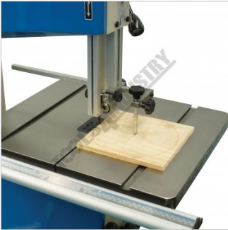
Shown On BP 310 Wood Bandsaw