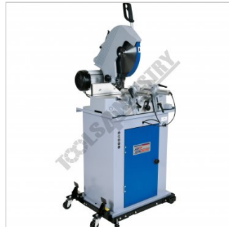
Shown With Machine