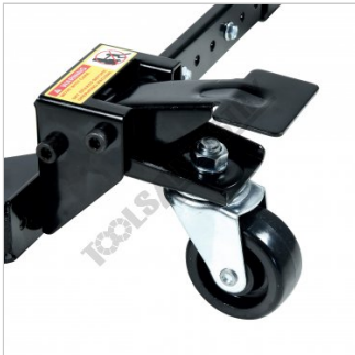
Castors That Swivel 360 Degrees