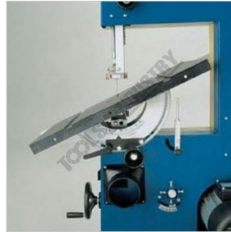
Large cast iron table with swivel capacity of -17deg to +45deg enhances versatility