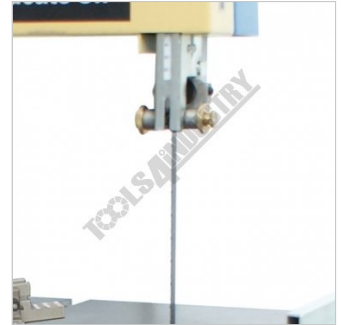
Twin 3 roller precision blade guides ensure precise cuts