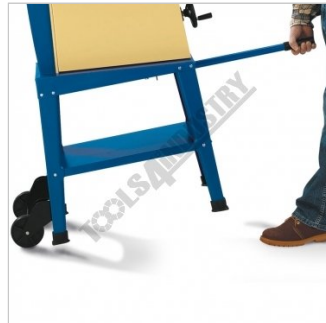
The new base unit with standard wheel base