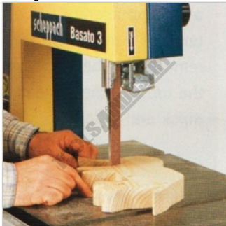
Unique variable speed drive system 370 750mm/min