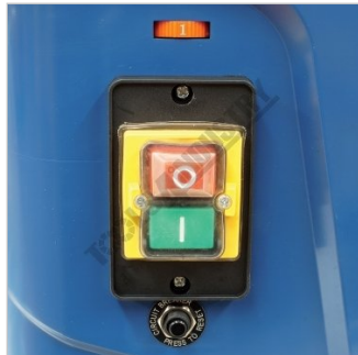
Speed Dial and Switch