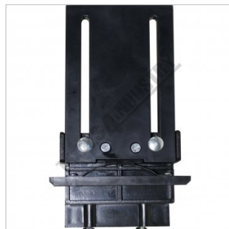
Top Clamp Rear View