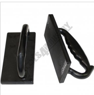
2 x Push Blocks