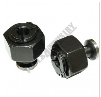
Includes 1/4" & 1/2" Collets