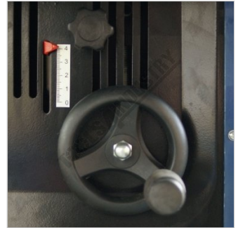
Spindle Height Adjustment