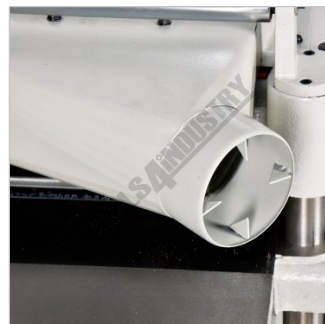
100mm Dust Outlet