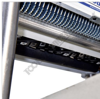
Five Helical Cutter Head With 80 Carbide Inserts