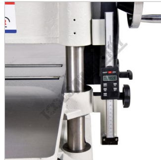
Digital Height Gauge