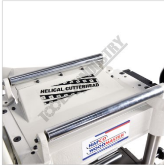
Top Rollers for Returning Material