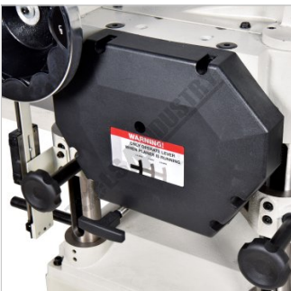
2 Speed Feed Gearbox