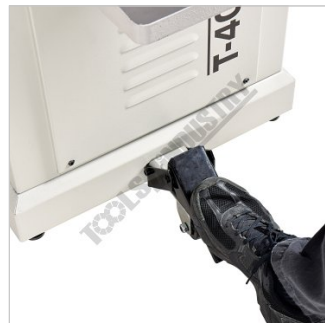
Moveable on Wheels