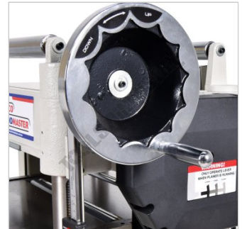
Height Adjustment Hand Wheel