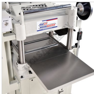
Cast Iron Infeed and Outfeed Tables