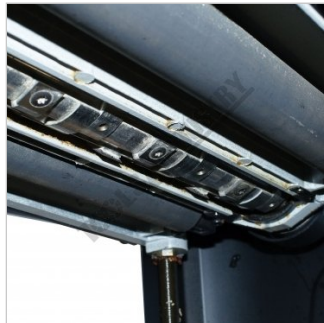
Spiral Cutter Head