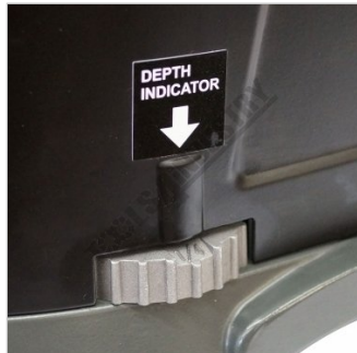
Pre-Set Depth Stop Dial