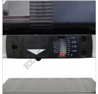
Thickness Depth Cut Indicator