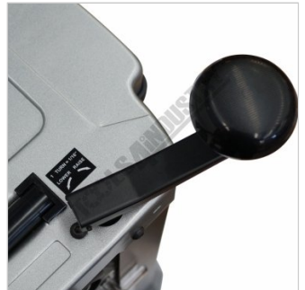
Height Adjustment Handle