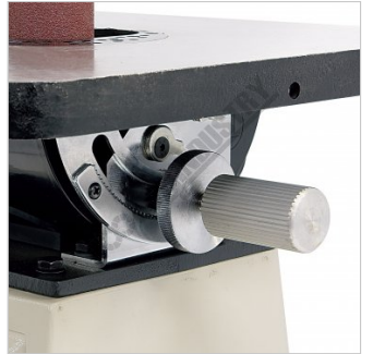
Table Tilt Geared Adjusting Dial & Lock - Left View