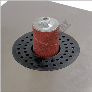
Table Insert for 90 Degree Sanding