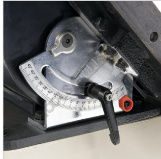
Table Tilt Lock Lever & Angle Degree Scale