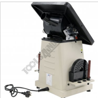
Table Tilted 45 Degrees - Rear Left View