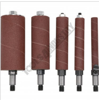
Sanding Sleeves Included