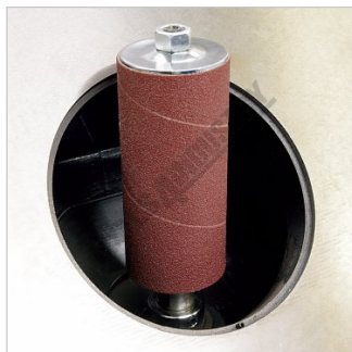
Sanding Spindle Mounted