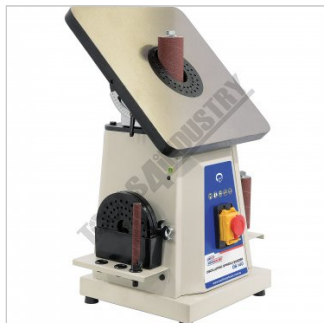
Table Tilted 45 Degrees - Front Left View