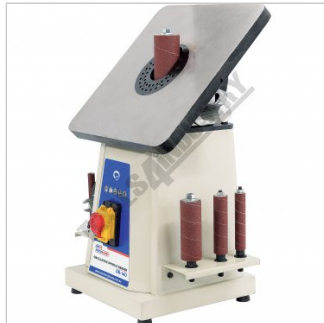
Table Tilted 45 Degrees - Right View