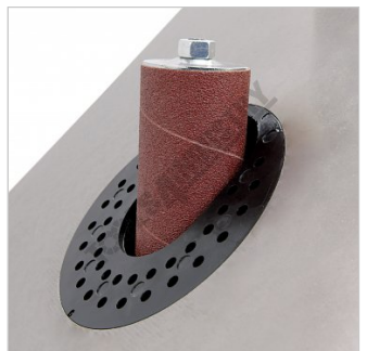
Table Insert for 45 Degree Sanding