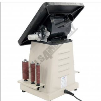
Table Tilted 45 Degrees - Rear Right View