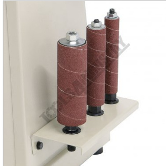
Storage Trays for Sanding Spindles