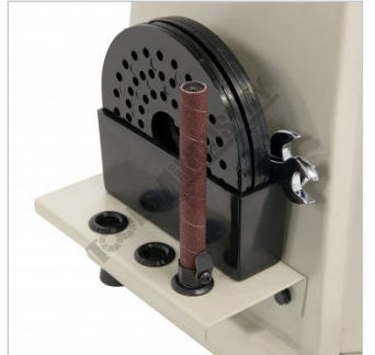
Storage Trays for Table Inserts & Spindles