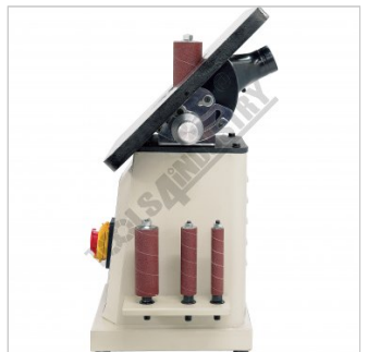
Table Tilted 45 Degrees - Right Side View