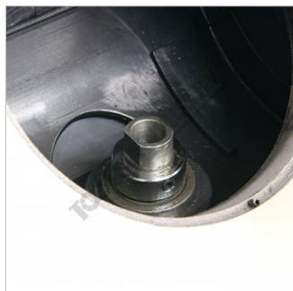
Sanding Spindle Drive Attachment