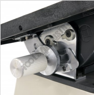
Table Tilt Geared Adjusting Dial & Lock - Right View