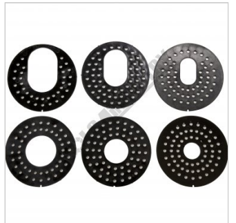
Table Inserts for 90 & 45 Degrees Sanding