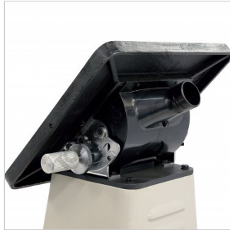
Table Tilted 45 Degrees - Rear View Close Up