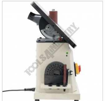
Table Tilted 45 Degrees - Side View