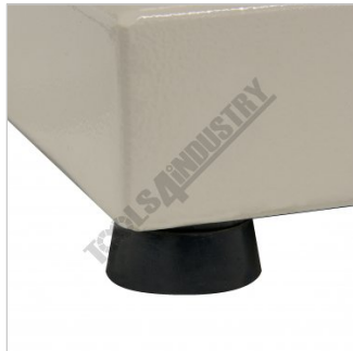
Anti Vibration Rubber Feet