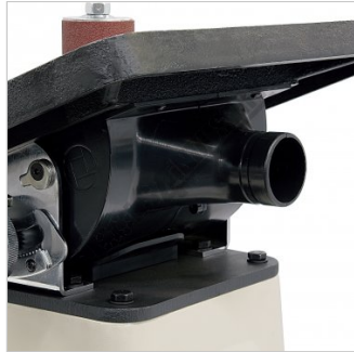
Ø50mm Rear Dust Chute Port