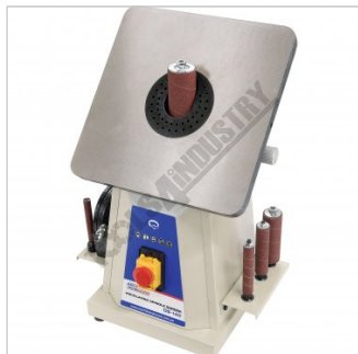
Table Tilted 45 Degrees - Top View