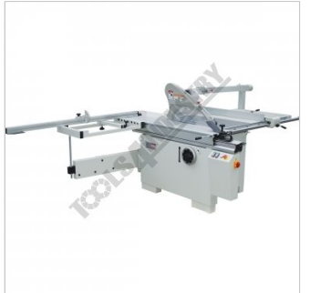
Main View Guard Down