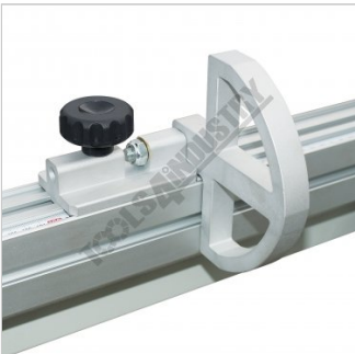
Flip Over Material Guide