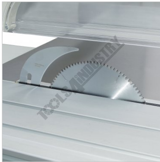
Main Blade Close Up