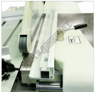
Heavy Duty Aluminium Extruded Fence with 2 Height Options