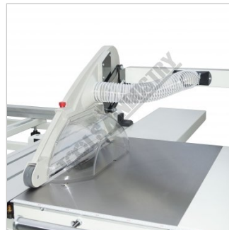
Tilting Blade Guard with Dust Extraction Hose