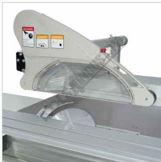
Tilting Blade Guard Raised