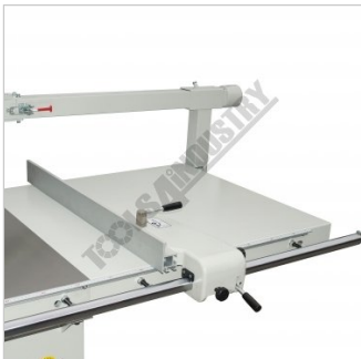
Fence Shown In High Position For Thicker Material