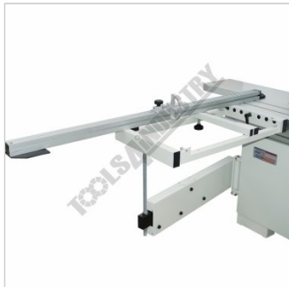
Solid Outrigger Table with Sliding Arm