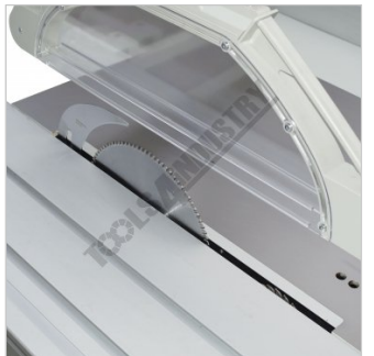
Main Blade with Scoring Blade