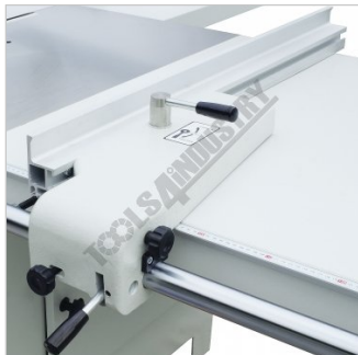
Heavy Duty Cast Fence Guide with Micro Adjustment