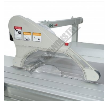
Tilting Blade Guard