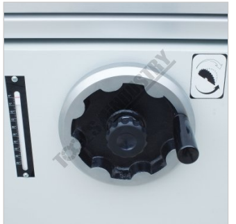
Blade Tilt Handle