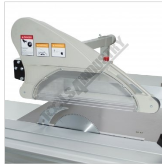
Blade Guard Raised Up