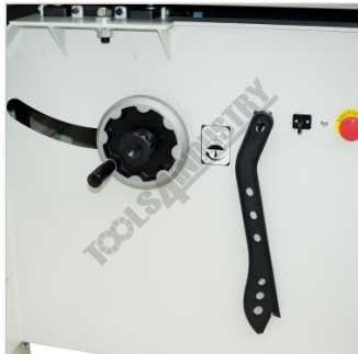
Blade Height Adjustment and Push Stick