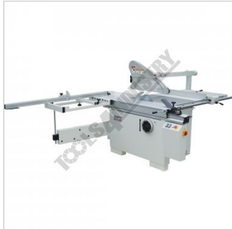
Main View Guard Up