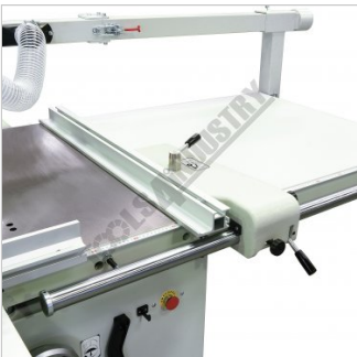
Fence Shown In Low Position For Thin Material