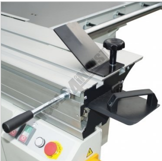
Table Handles and Table Lock