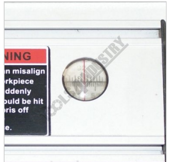
Rip Fence Sight Glass