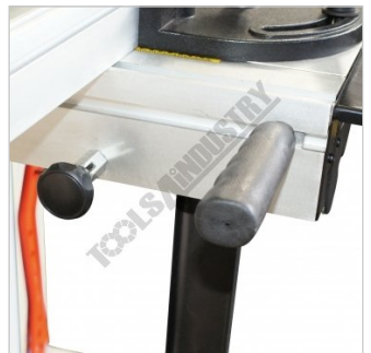
Sliding Table Lock