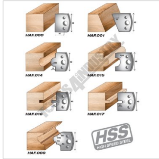
7 Sets of 40mm HSS Profiled Knives