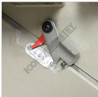
In Feed Table Height Adjustment Scale