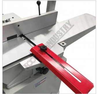
Adjustable Slide Out Cutter Guard