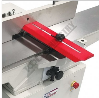
Cutter Guard Adjustment