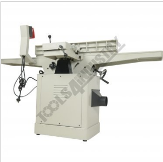
Rear Low View