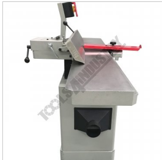
Side View with Fence at 45 Degrees