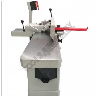
Side View with Fence out