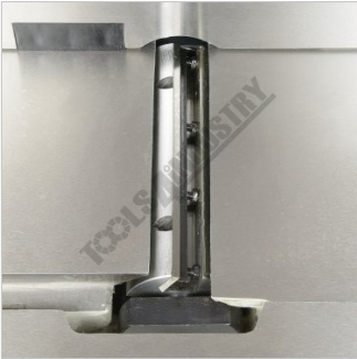
4 Blade Cutter Head