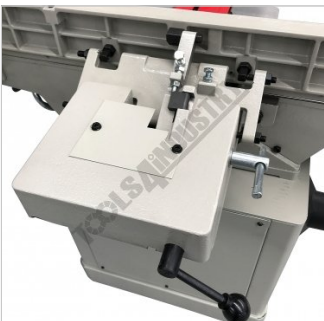
Adjustable Quick Action Tilt Fence Assembly