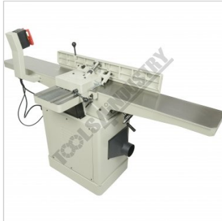
Rear Top View