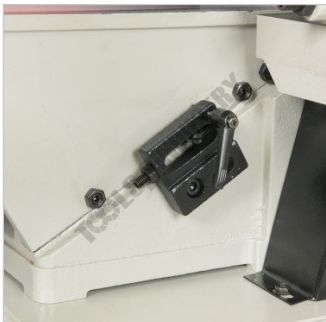
In Feed Table Height Stop Setting