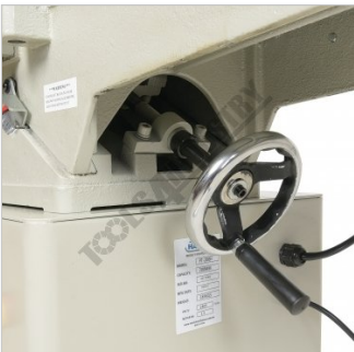
In Feed Table Height Adjustment Handle