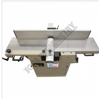
Front Top View