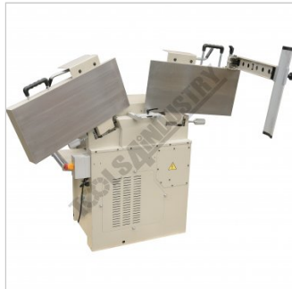
Thicknesser Setup - Rear View