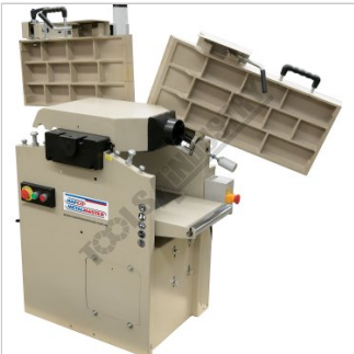
Set Up as a Thicknesser