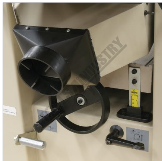
Dust Chute Set Up For Planer