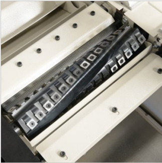
Spiral Cutter Head