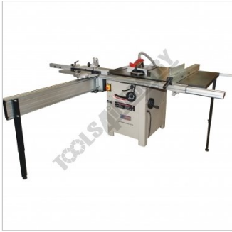
Shown With Optional Table Saw