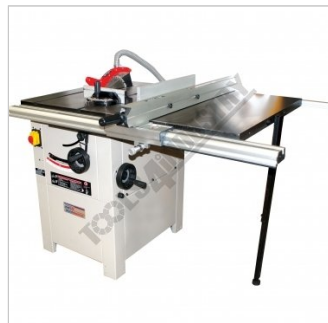
Shown with Table Support & Leg