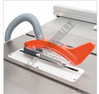
Blade Guard with Dust Hose