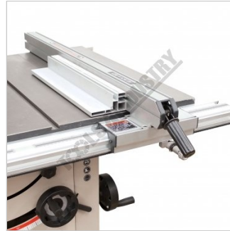
Rip fence Left View