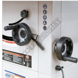
Blade Adjustment Handles