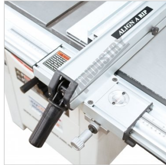
Heavy Duty Rip Fence with Micro Adjustment