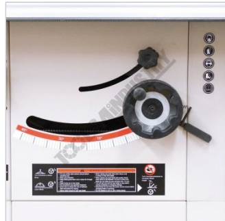
Blade Angle Adjustment