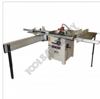
Shown With Optional Sliding Table