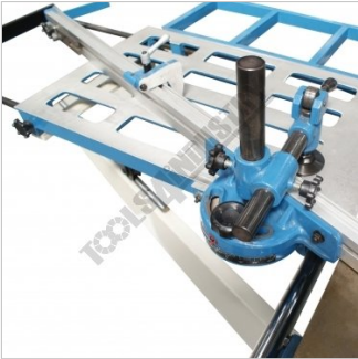
Sliding Table with Mitre Guide and Material Clamp