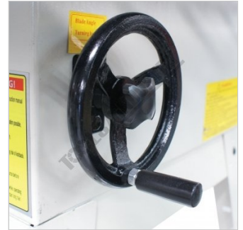
Tilting Arbor Hand Wheel and Lock