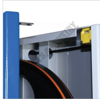
Safety Micro Switch On Door