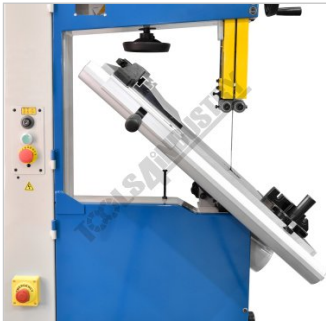
Cast Iron Table Tilts to 45 Degrees