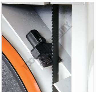
Blade Cleaning Brush