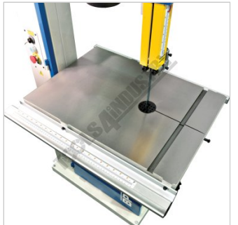
Large Cast Iron Table