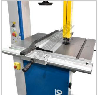
Sliding Rip Fence Down Position