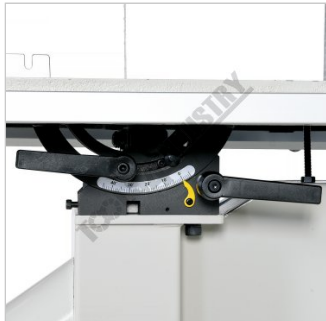
Table Tilt Adjustment