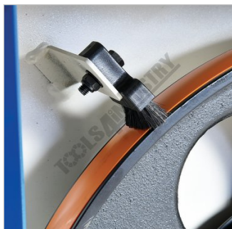
Wheel Cleaning Brush