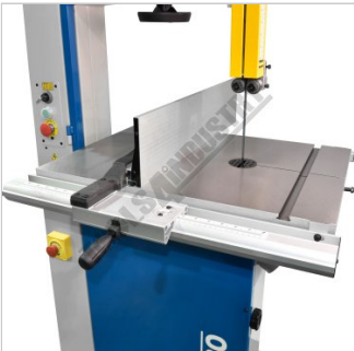
Sliding Rip Fence Up Position