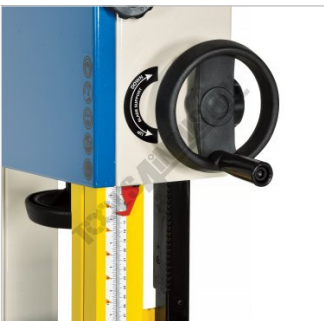
Rack Pinion Adjustment On Top Blade Guide