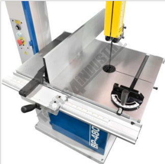
Large Cast Iron Table and Mitre Guide