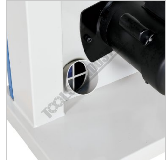
100mm Bottom Rear Dust Chute