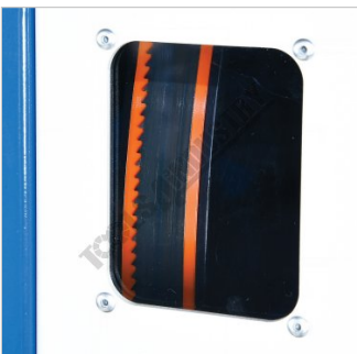
Blade View Window