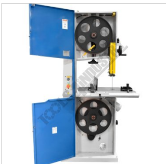
Shown With Blade Door Open