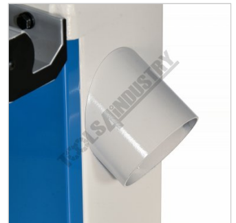
100mm Side Dust Chute