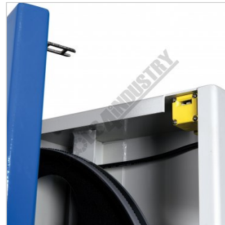
Safety Micro Switch On Door