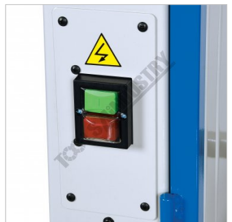
ON OFF Switch