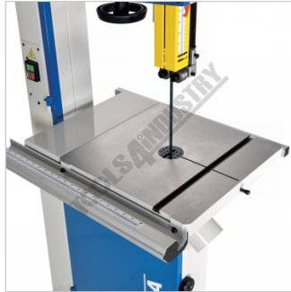
Large Cast Iron Table