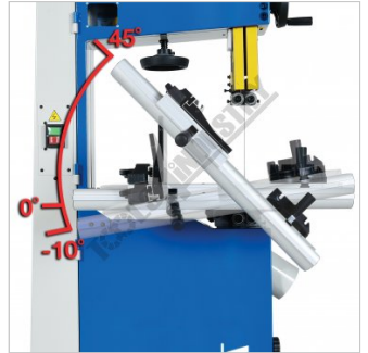
Table Angle Adjustment