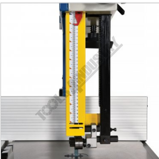
Blade Height Scale