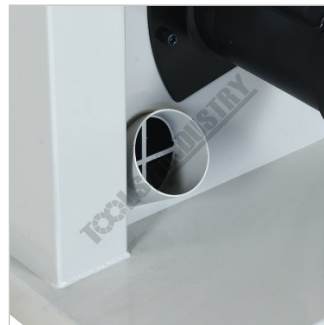
100mm Bottom Rear Dust Chute