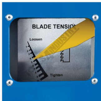
Blade Tension Window