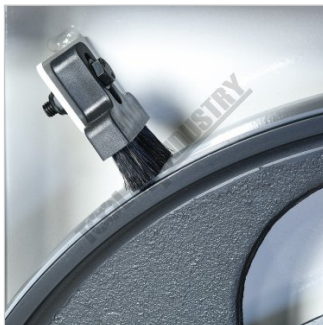
Wheel Cleaning Brush