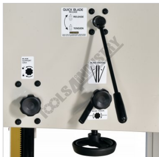
Quick Action Blade Tension Lever