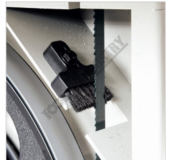
Blade Cleaning Brush