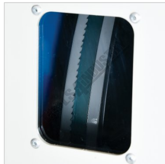
Blade View Window