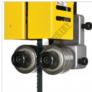
Ball Bearing Blade Guide