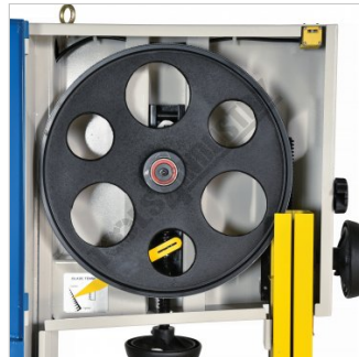
Heavy Duty Cast Iron Wheels