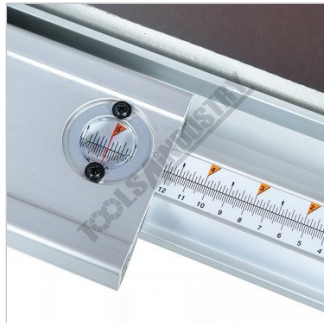
Rip Fence With Magnification Scale View