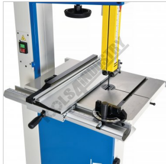
Rip Fence Shown In Low Position