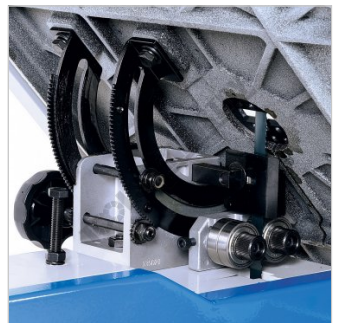
Lower Ball Bearing Blade Guide