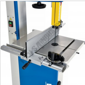
Rip Fence Shown In High Position