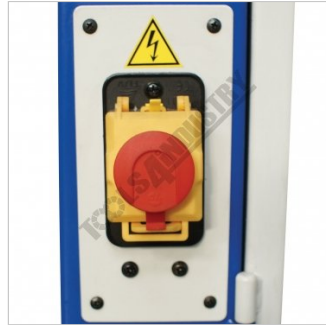
Magnetic Stop Switch