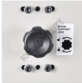
Blade Support Lock