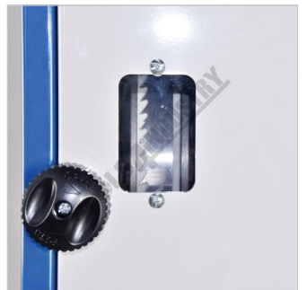
Blade View Window