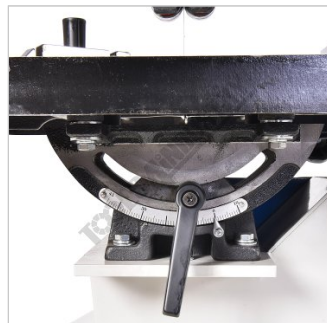
Table Tilt Adjustment