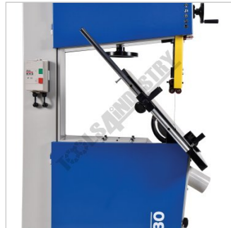
Cast Iron Table Tilts to 45 Degrees