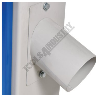
100mm Side Dust Chute