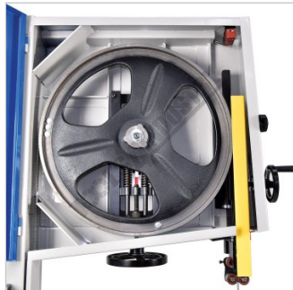
Heavy Duty Cast Iron Wheels