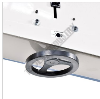
Blad Tension Lever