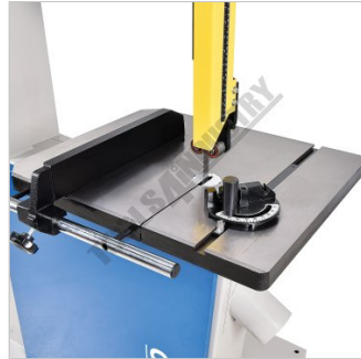
Cast Iron Table