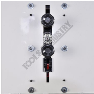
Blade Width Tension