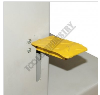
Foot Brake Lever