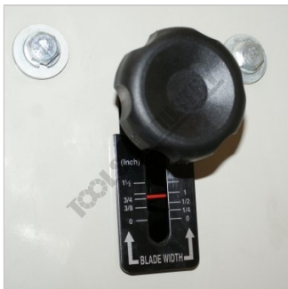
Blade Width Tension Indicator