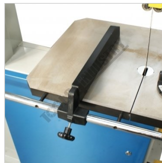
Sliding Rip Fence