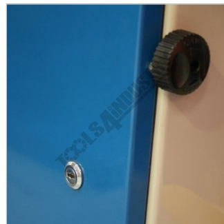
Key Lockable Blade Covers