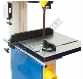
Table with Sliding Rip Fence