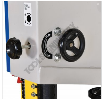
Blade Height Adjustment-Lock