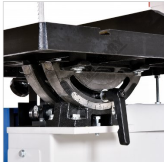
Table Tilt Adjustment