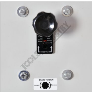
Blade Width And Tension