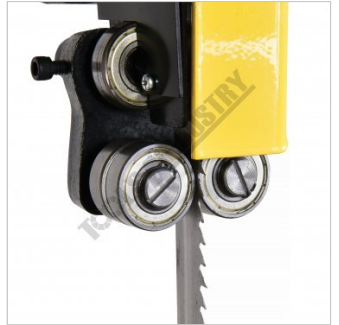
Ball Bearing Blade Guide