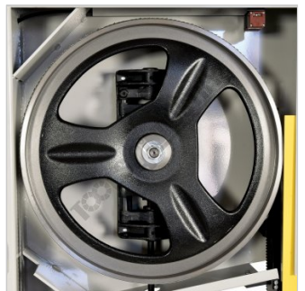
Heavy Duty Cast Iron Wheel