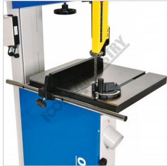
Table With Sliding Fence