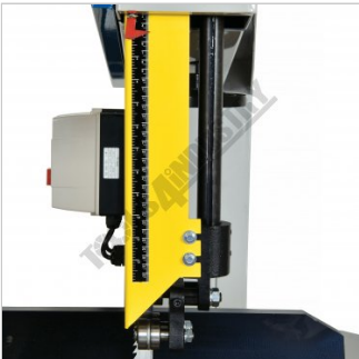
Blade Height Indictaor