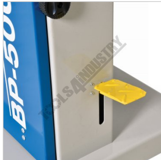
Foot Brake Lever