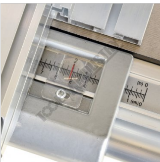
Rip Fence Magnification View Window