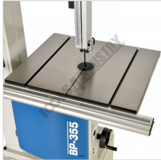
Large Work Table