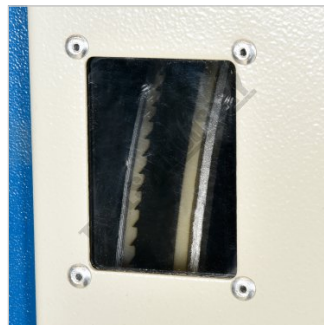
Blade Tracking Side View Window