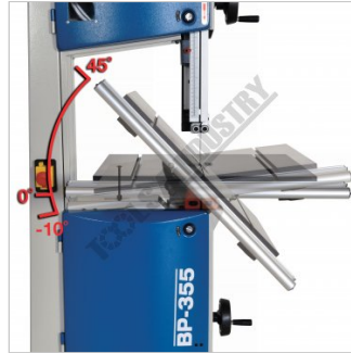
Table Adjustment Angles