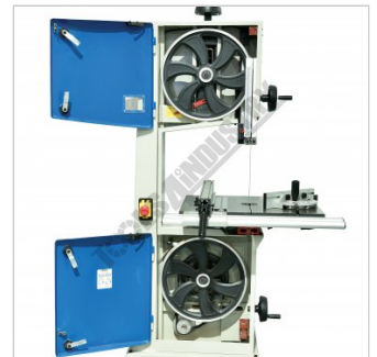
Blade Guards Fitted with Safety Micro Switches