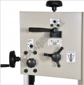
Blade Release Tension - Tracking & Blade Lock