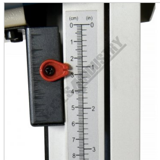
Blade Height Scale