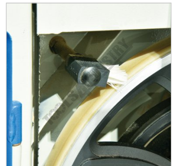
Wheel Cleaning Brush