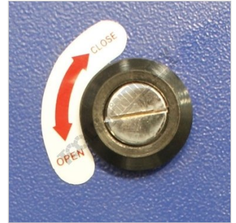
Safety Locks on Doors