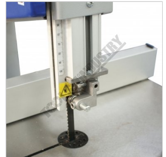
Geared rack height adjustment