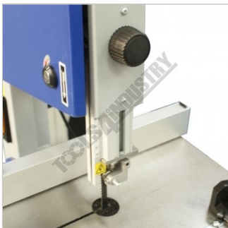
Blade Guide Adjustment