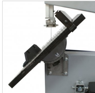
Cast Iron Table Tilts 0 45 degrees