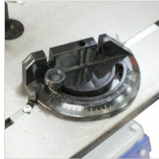
Mitre Guide 0 45 Degrees