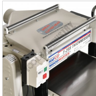
Feed Return Rollers