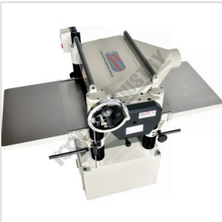
Cast Iron Feed Tables