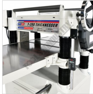
Robust 4 Post Design