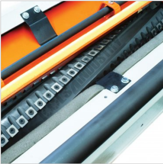
4 x Spiral Cutter Head with Carbide Inserts