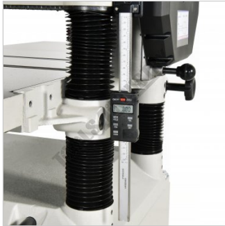
Digital Height Readout