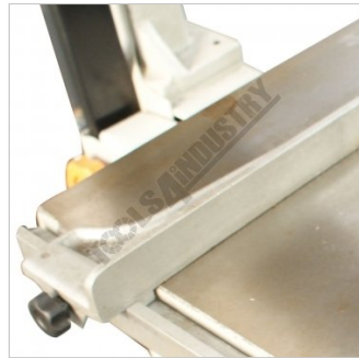
Sliding Rip Fence