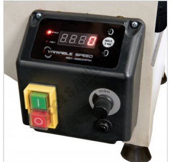
Electronic Variable Speed