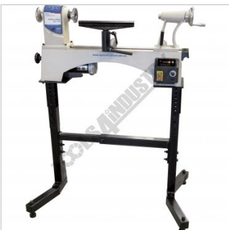
Shown on Optional Stand