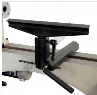
300mm Tool Rest