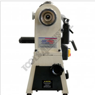
Left End View