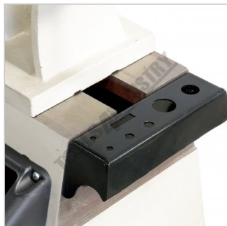
Tool Storage Tray