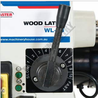
Variable Speed Lever