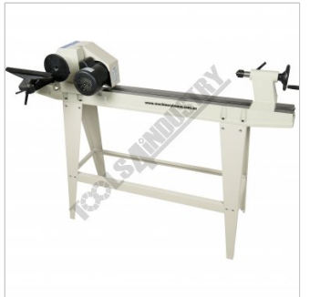
Bowl Turning Setup Right View