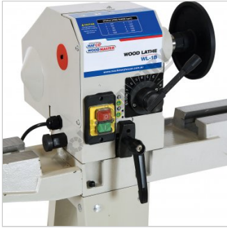
Headstock Left View