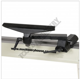
Outrigger Tool Rest