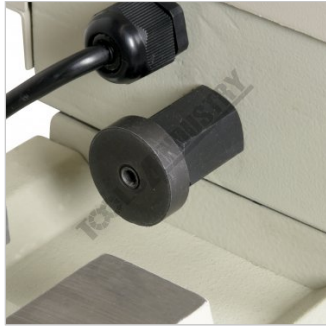
Swivel Head Release Lock