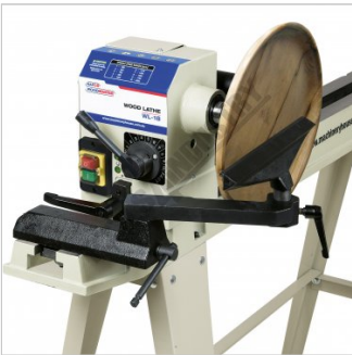
Shown Set Up with Bowl