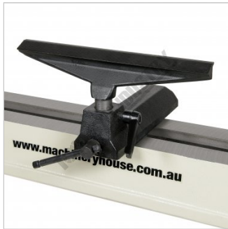
Standard Tool Rest