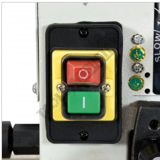
Switch On Off