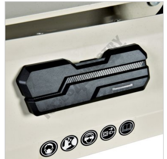
Blade Storage Holder