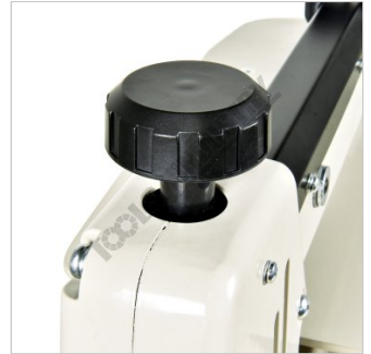
Blade Tension Handle