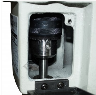
Keyed Chuck for Drill Bit