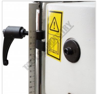
Mortice Head Depth Stop Gauge