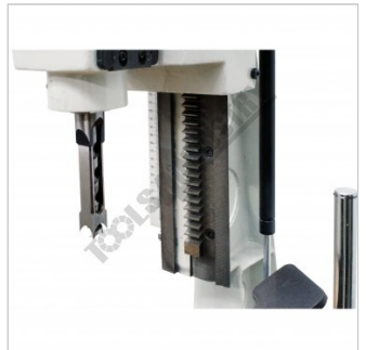
Rack and Pinion Head Movement