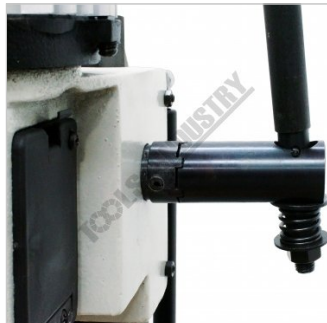
Handle Repositioning via Drive Dog System