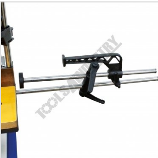
Adjustable Length Stop