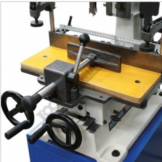
Adjustable Table with Vice Clamps