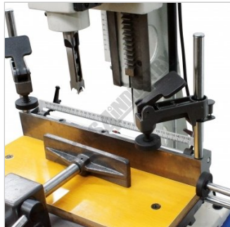
Overhead Material Clamps