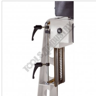
Dovetail Vertical Head Slide