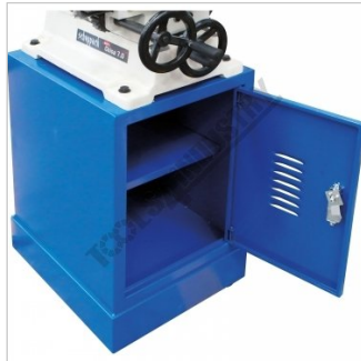
Cabinet Stand with Key Lock