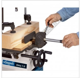
Cam Lever Vice Clamping