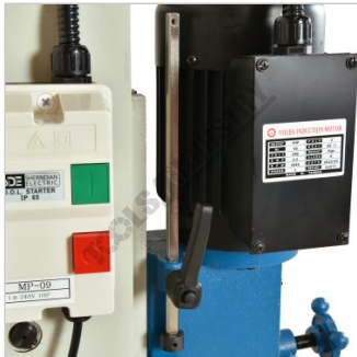
Adjustable depth stop