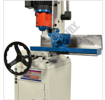
Table movement left and right