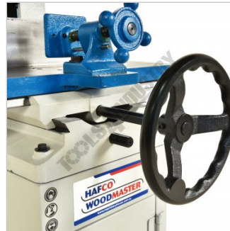
Cross slide and table travel handwheel