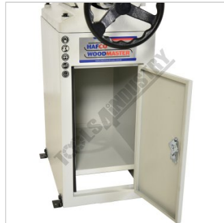
Large storage cabinet