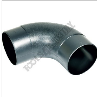
2 x 90 Degree Elbows Top View