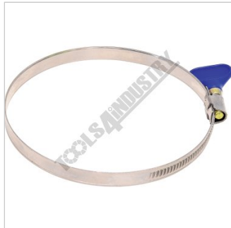
16 x Hose Clamps to Suit 100mm Hose