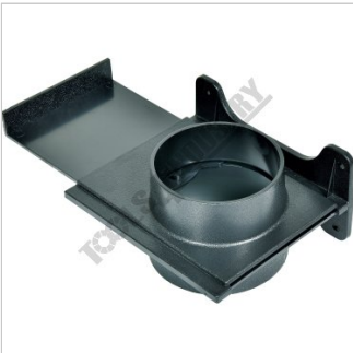
3 x Wall Mount Blast Gates Open