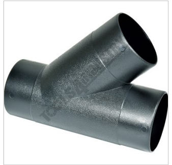
2 x Y Connectors Top View