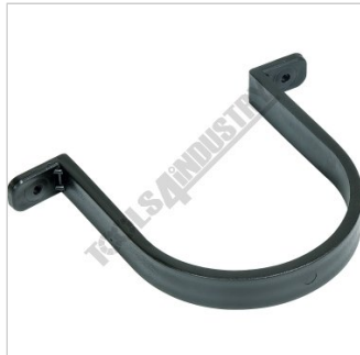
10 x Tube Hanging Brackets Top View