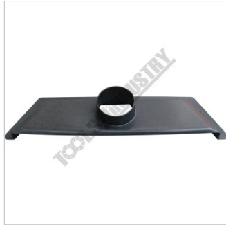
1 x Floor Sweeping Attachment