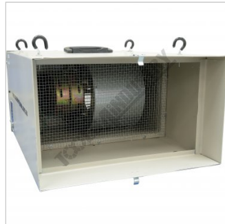
Shown with Filters Removed