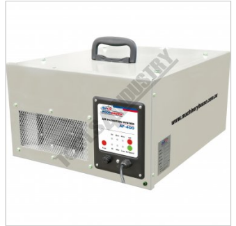
Shown with Lifting Handle