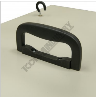
Lifting Carry Handle