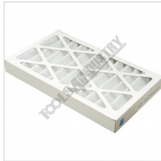
First Stage External Filter