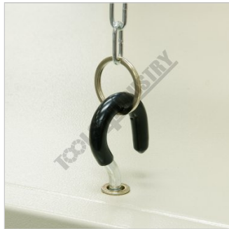
Swivel Mounting Hooks