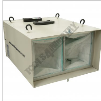
Rear View with 1st Stage Filter Removed