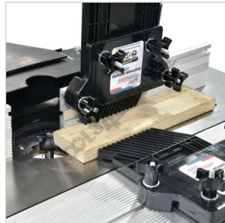
In Use Router Table