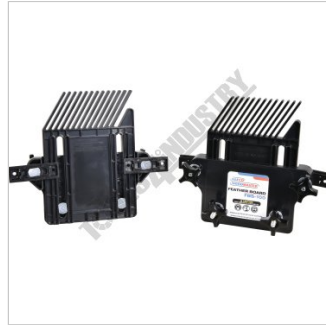
Front and Rear View