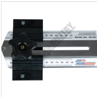
Set At Minimum Adjustment