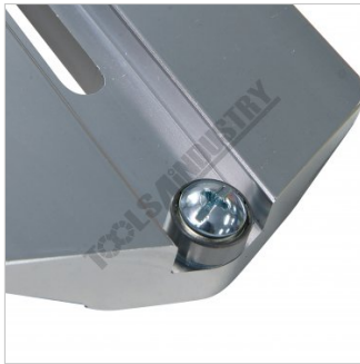
Ball Bearing For Smooth Feed