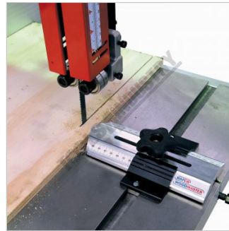
Shown In Use on Bandsaw