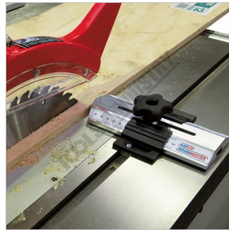
Shown In Use on Table Saw