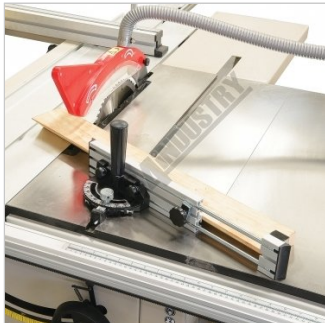
Shown on a Table Saw