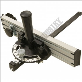
Fence Fully Closed