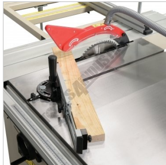
Shown on a Table Saw Side View