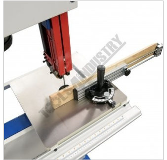
Shown on Wood Bandsaw