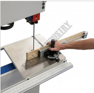
Shown on a Wood Bandsaw Action