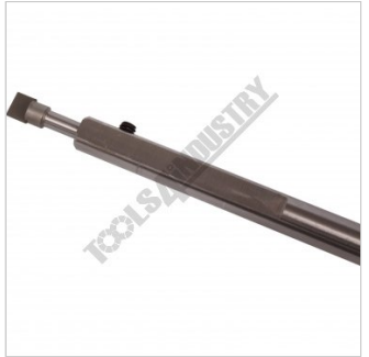
Carbide Tip Secured With Grub Screw