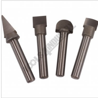
4 x Carbide Cutting Tips