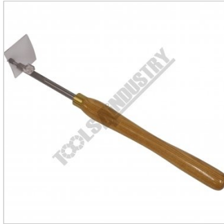
Shown With Guard