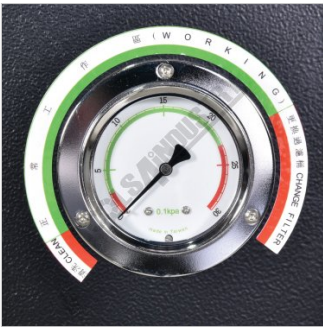
Differential Pressure Gauge