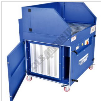
Filter door open