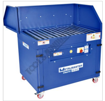
Side door open