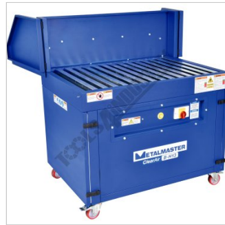
Side doors open