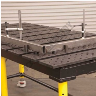
The Stops Provide Low Profile Locating and Make Workpiece Removal Easy