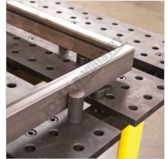
Quick Effective Locating and Positioning of Stock