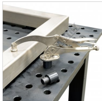
Optional Clamp C103 shown screwed into Threaded Riser