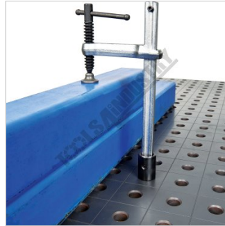
Shown Clamping 2 Lengths of Square Tube