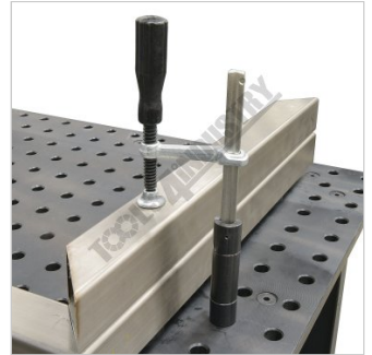
Optional Threaded Riser & Adaptor (W08513 & W08515)