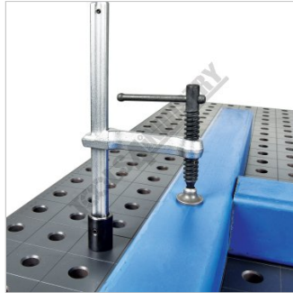
Shown Clamping Square Tube