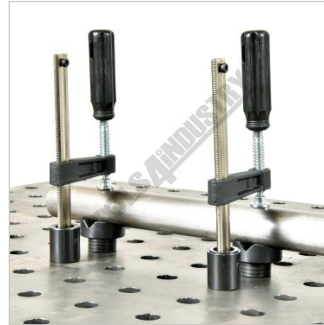
Clamps Shown Clamping Round Tube