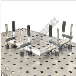
Round Tube Setup with Extra 2 Clamps and V Pads