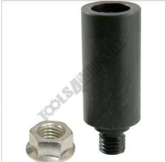
4 x Positioning Stop