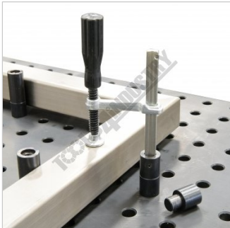
Shown Screwed into Optional Adaptor View2