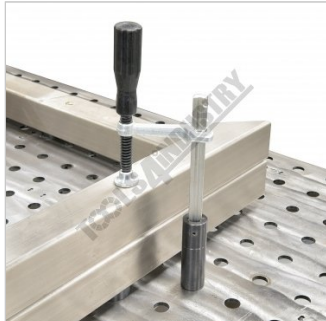
Shown Screwed into Threaded Riser