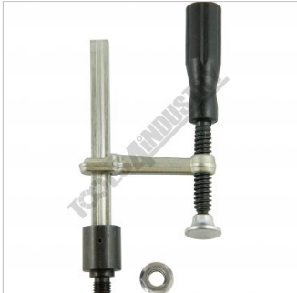
4 x Clamp