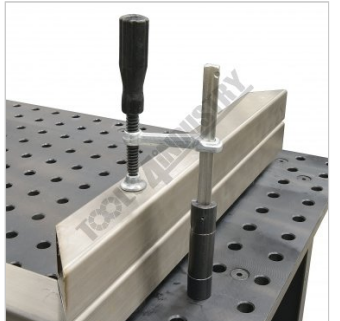
Shown Screwed into Threaded Riser with Optional Adaptor