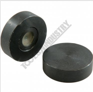
8 x Magnetic Rest