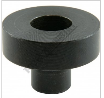
4 x V Spacer