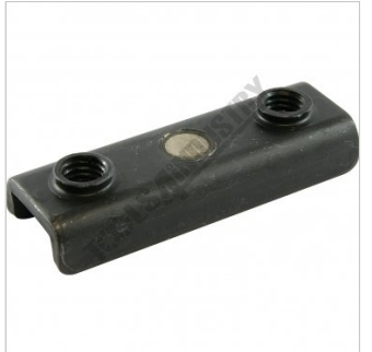
4 x Threaded Magnetic Adaptor