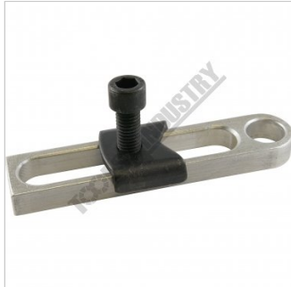
4 x Stop Bar Assembled