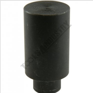
4 x Insert Stop