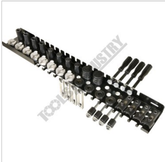
Shown on Optional Tool Tray (W08524)