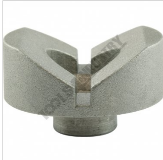
8 x V Block