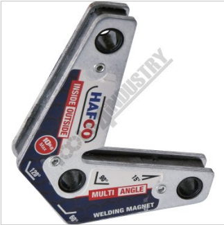
2 x WCM 4A Multi Angle Corner Magnets