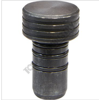
6 x SCLP 16 Locating Pin 16x40mm