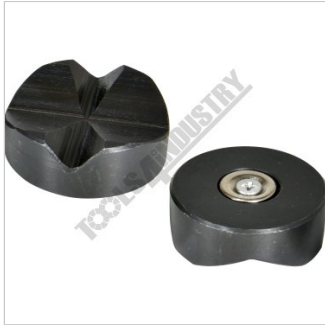
4 x SCVM 90135 Magnetic Cross Type 90 and 135 Degree V Pad