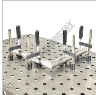
Round Tube Setup with 4 x Clamps and V Pads