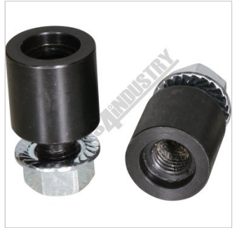
4 x SCA 253M 25mm Multi Purpose Threaded Stop