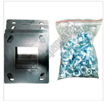
Includes Base Plate Kit for Optional Castor Wheels