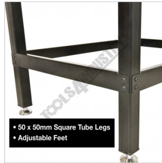
Steel Leg Bracing with Adjustable Feet