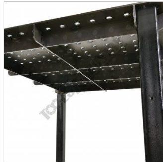
Rib Design for Strength